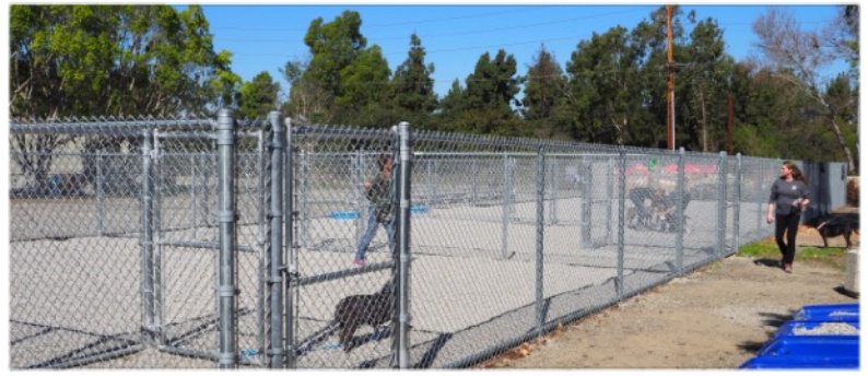
Reed's Corner - A Playground for Shelter Dogs

Reed's Corner is a dog playground that consists of 3 secured fenced in areas where the shelter dogs get a break from their kennels and can run, play and get some needed exercise. It has been found that dogs that are allowed to get out of their kennels to play are less stressed, calmer, more social and are more adoptable.